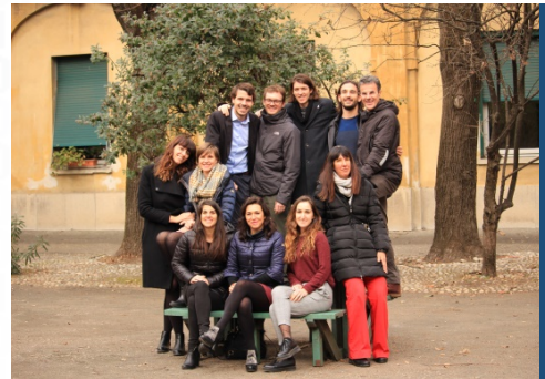
The Pavia University team (above); the project partners (below)

This project has received funding from the European Union's Horizon 2020 research and innovation program under grant agreement No 825215