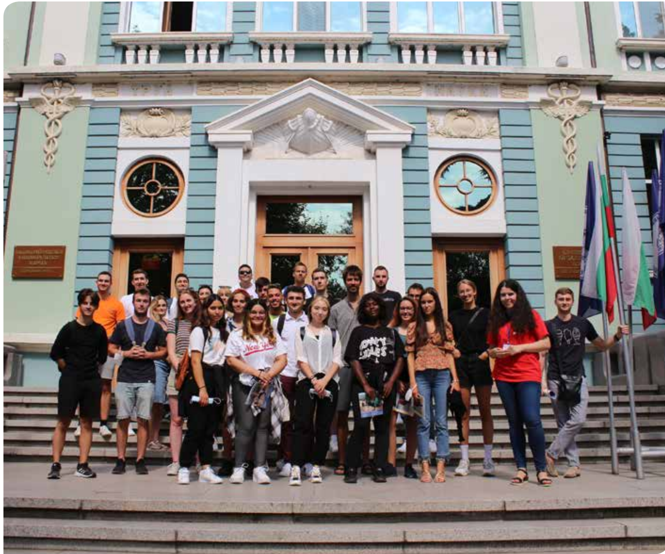
Incoming Erasmus+ Students 2021/2022 academic year