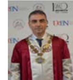
Vice-Rector for International Relations and Partnerships

The International Relations Office is responsible for the establishment and coordination of international contacts with other institutions of higher education. Some of the main functions of the office include: assists foreign students studying at UE–Varna, and incoming and outgoing mobility students; Management and the implementation of international agreements; Collection and dissemination of information about international programmes; Opportunities to receive grants and study abroad; Coordination of trainings, vocational trainings and practical mobility (recruitment of applicants, preparation of documents) are some of the main functions of the office.