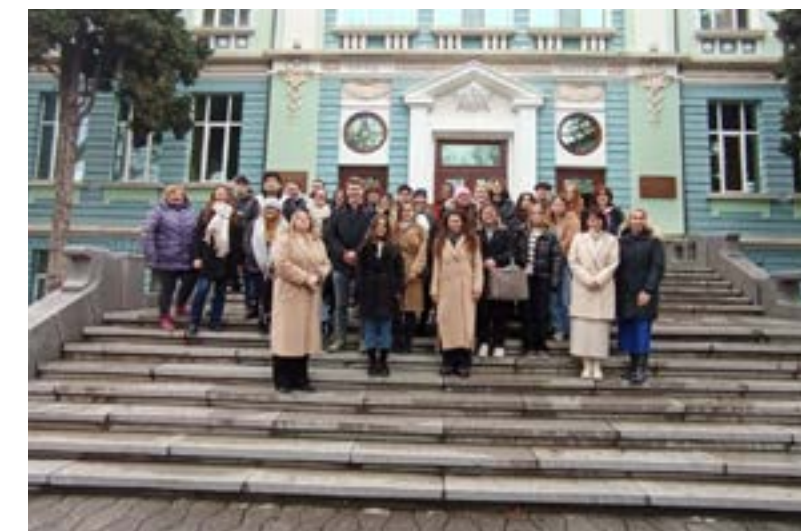
Incoming Erasmus+ Students 2024/2025 academic year